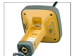
Rugged 11.2 oz. Mg die cast GPS case takes 6.5 ft. drops to concrete