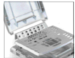
Four Mg ultrasound case castings weigh 1.73 lbs.

For more on how CWM's innovations, skills, and unique experience in magnesium die casting can help assure die cast project success, contact CWM.