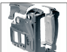
Mg digital camera case: .25 lb. weight reduction